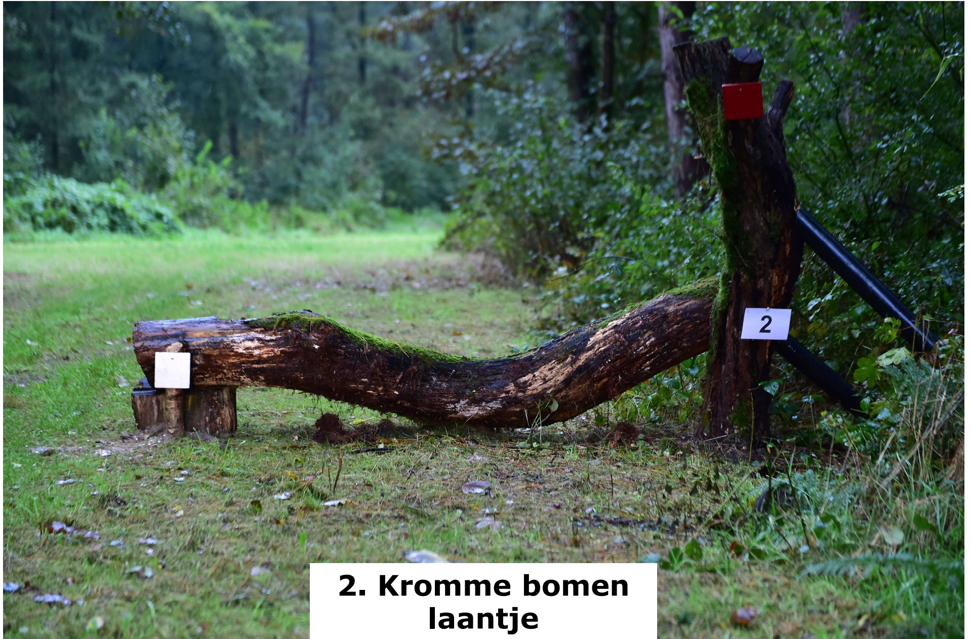
2. Kromme bomen laantje