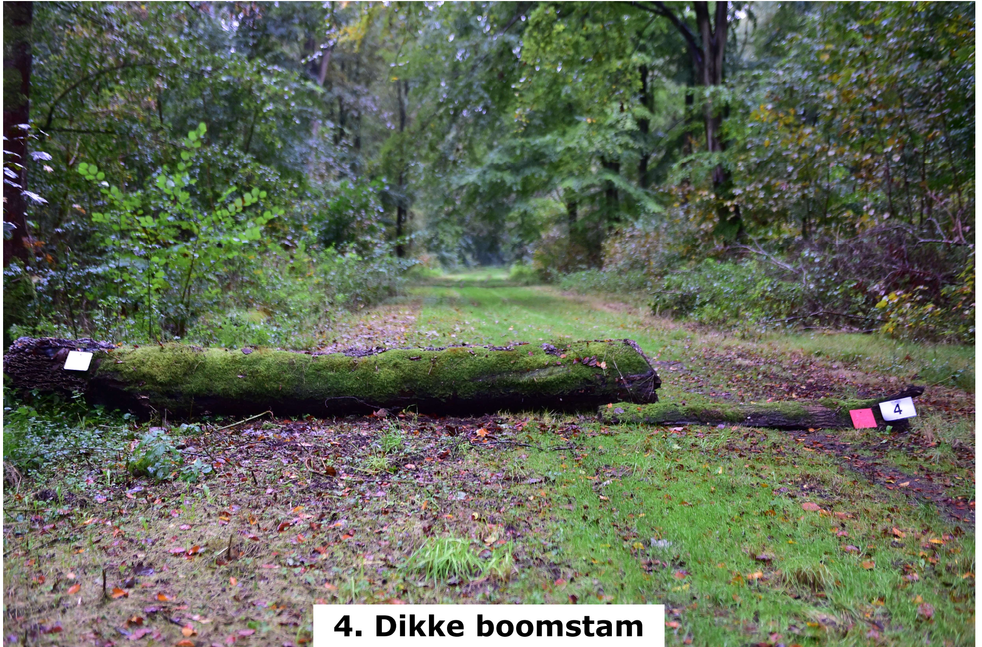
4. Dikke boomstam